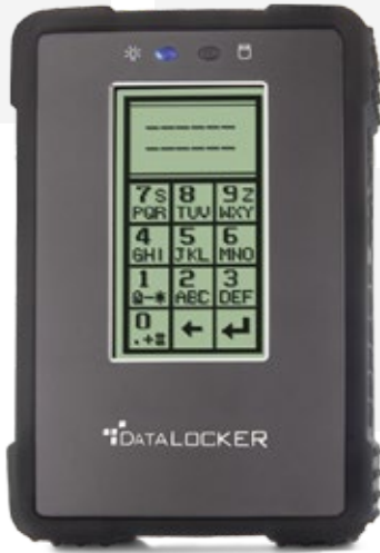
Patented, touch-screen technology. Screen simulated.