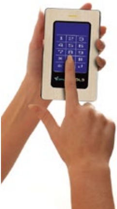
Patented touch-screen technology

Say goodbye to complicated software or drivers – all DL3 encryption, administration, and authentication are performed on the unit itself and managed through easy-to-use touch screen technology.