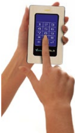
Patented touch-screen technology

Say goodbye to complicated software or drivers – all DL3 encryption, administration, and authentication are performed on the unit itself and managed through easy-to-use touch screen technology.