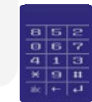
Rotating Keypad (To Prevent Surface Analysis)